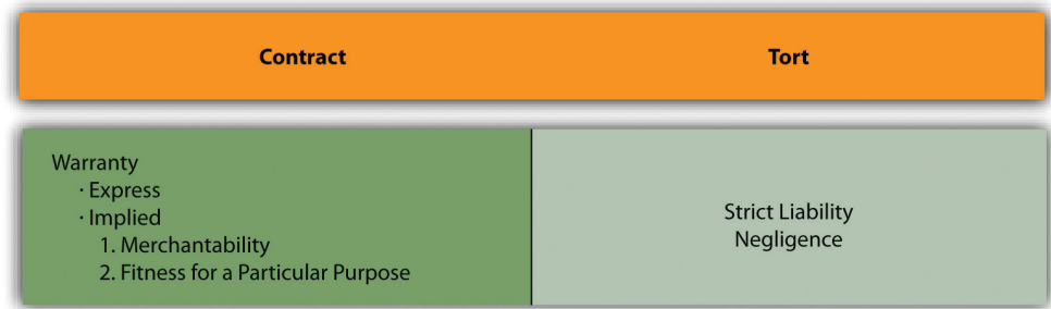
Figure 20.1 Major Products Liability Theories