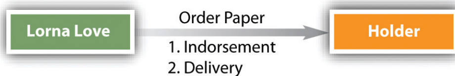
Figure 14.2 Negotiation of Order Paper