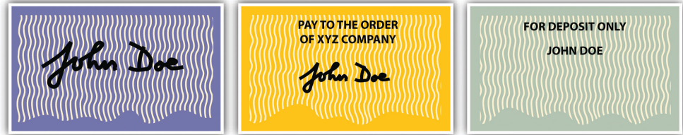
Figure 14.4 Forms of Endorsement

A blank indorsement creates conditional contract liability in the indorser: he is liable to pay if the paper is dishonored. The blank indorser also has warranty liability toward subsequent holders.