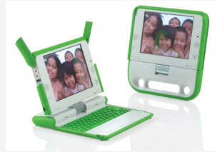
Figure 4.3 The XO PC