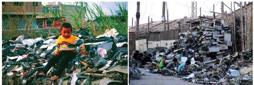
Figure 4.4 Photos from Guiyu, China John Biggs, "Guiyu, the E-waste Capital of China," CrunchGear , April 4, 2008.