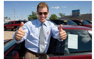
Figure 8.4 Shady used car salesman.

Now appears our hero, the used car dealer, who is literally a dealer in the same sense a securities dealer is: he buys from sellers at one (bid) price and then sells to buyers at a higher (ask) price. He earns his profits or spread by facilitating the market process by reducing asymmetric information. Relative to the common person, he is an expert at assessing the true value of used automobiles. (Or his operation is large enough that he can hire such people and afford to pay them. See the transaction costs section above.) So he pays more for peaches than lemons ( ceteris paribus , of course) and the used car market begins to function at a much higher level of efficiency. Why is it, then, that the stereotype of the used car salesman is not very complimentary? That the guy in Figure 8.4 "Shady used car salesman." seems more typical than the guy in Figure 8.5 "Not-so-shady used car salesman." ?