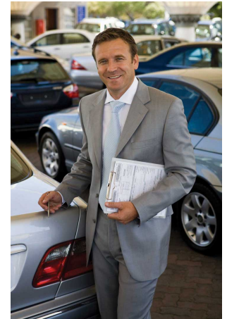
Figure 8.5 Not-so-shady used car salesman.

Several explanations come to mind. The market for used car dealers may be too competitive, leading to many failures, which gives dealers incentives to engage in rent seeking (ripping off customers) and disincentives to establish long-term relationships. Or the market may not be competitive enough, perhaps due to high barriers to entry. Because sellers and buyers have few choices, dealers find that they can engage in sharp business practices http://www.m-w.com/dictionary/sharp and still attract customers as long as they remain better than the alternative, the nonfacilitated market. I think the latter more likely because in recent years, many used car salesmen have cleaned up their acts in the face of national competition from the likes of AutoNation and similar companies. http://en.wikipedia.org/wiki/AutoNation Moreover, CarFax.com and similar companies have reduced asymmetric information by tracking vehicle damage using each car's unique vehicle identification number (VIN), making it easier for buyers to reduce asymmetric information without the aid of a dealer.