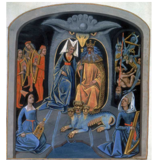
Figure 8.3 Adverse selection, moral hazard, and agency problems incarnate

Financial intermediaries and markets can reduce or mitigate asymmetric information, but they can no more eliminate it than they can end scarcity. Financial markets are more transparent than ever before, yet dark corners remain. http://www.investopedia.com/articles/00/100900.asp The government and market participants can, and have, forced companies to reveal important information about their revenues, expenses, and the like, and even follow certain accounting standards. http://www.fasb.org/ As a CEO in a famous Wall Street Journal cartoon once put it, "All these regulations take the fun out of capitalism." But at the edges of every rule and regulation there is ample room for shysters to play. http://knowledge.wharton.upenn.edu/