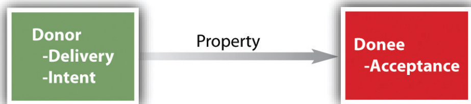
Figure 29.1 Gift Requirements